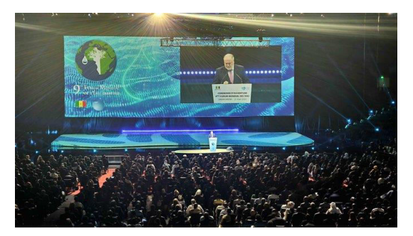
Figure - Speech by Mr Loic Fauchon President World Water Council in Opening Ceremony 9th World Water Forum

the expectations of the forum. Mr Loïc Fauchon, President of the World Water Council and co-organizer