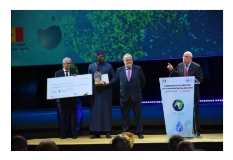
Figure: most prestigious and globally recognized prizes 'The Hassan II World Water Prize' was given to the Organisation for the Development of the Senegal River (OMVS)

One of the most prestigious and globally recognized prizes 'The Hassan II World Water Prize' was given to the Organisation for the Development of the Senegal River (OMVS). It contributes to creating global awareness and taking concrete measures to promote the cause of water. The prize is awarded at every World Water Forum and the Moroccan Minister of Equipment